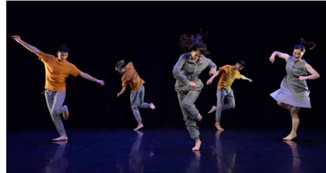
'Impermanent Ceremony #2: Stepping on Snails' by J'son Howard (USA).