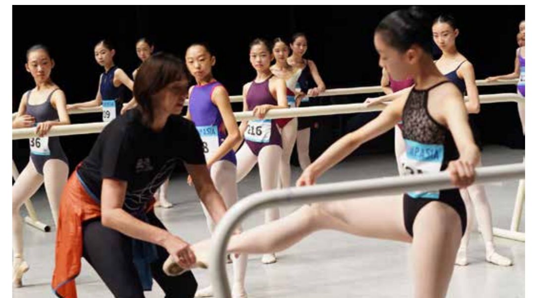
Master Class by Nina Ananiashvili, a 'Bolshoi Star' and the artistic director of the State Ballet of Georgia, at Tanzolymp Asia, Chung-Ang University Art Center, 28 July 2019.

Many executive officials of Jeju Provincial government attended the final day's performance and expressed their deep appreciation for the performance by giving many rounds of applause.