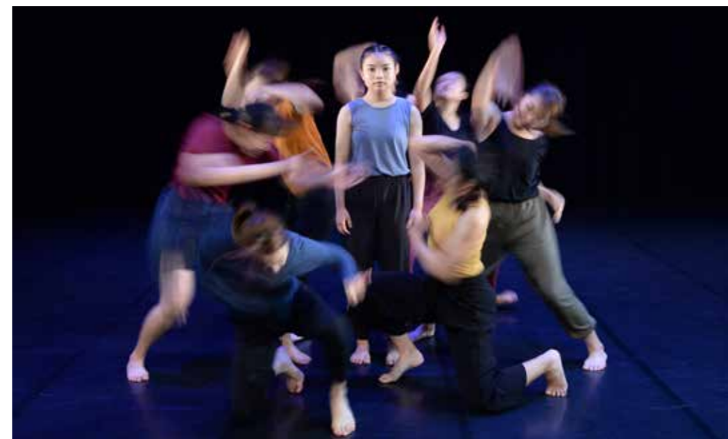
'Paradise' by Chun-yu Lin (TWN).