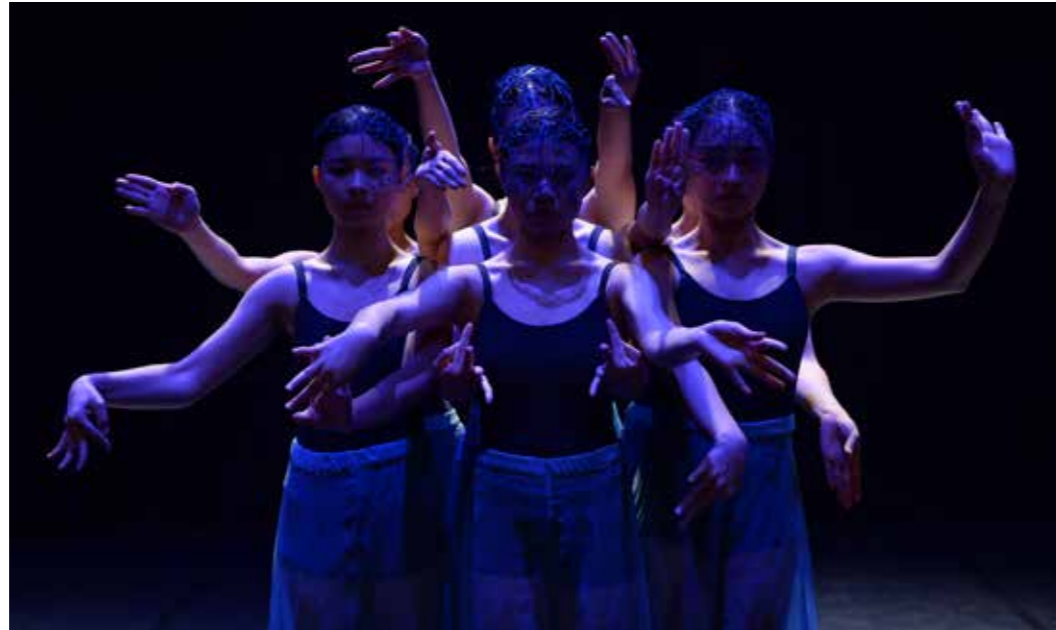
'Whisper' by Visaka Saeui (THAI).

media, but living people. I feel that dance is not an aesthetic standard of action; it's how you use it, perform it, allow it to infect your actions from inside out. Enjoy yourself every second on stage, find the most natural and sensible side of the dancer. Excavate it.