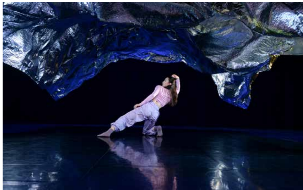
'Common Ground' by Emma Fishwick (AUS).