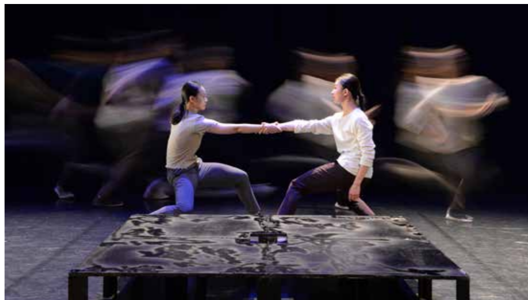
'Horizon 00:01' by Yung-chen Yeh (TWN).

For the last section, I told them, "Let's run the marathon of life." Eight girls lined up. In the beginning, it was difficult to finish; they needed to calculate the number and size of the steps. They had to take care of each other to merge with the other group. We practiced many times and failed many times... but they actively discovered these problems and learned how to solve them together.