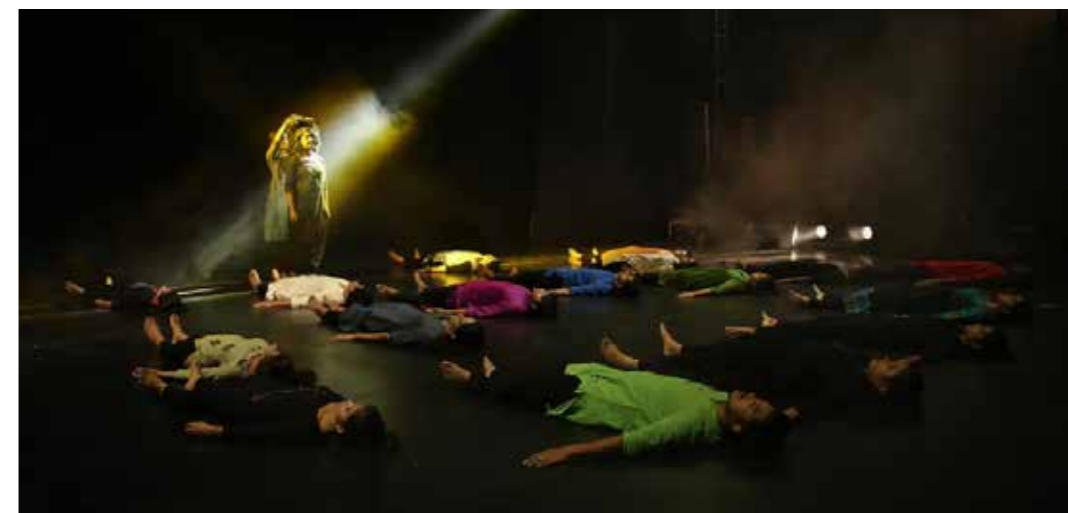
'Chaand... The Reflection of a Wish,' the culminating performance by the choreolab participants, on 25 November 2019, at Cox's Carnival, Cox's Bazar, Bangladesh.