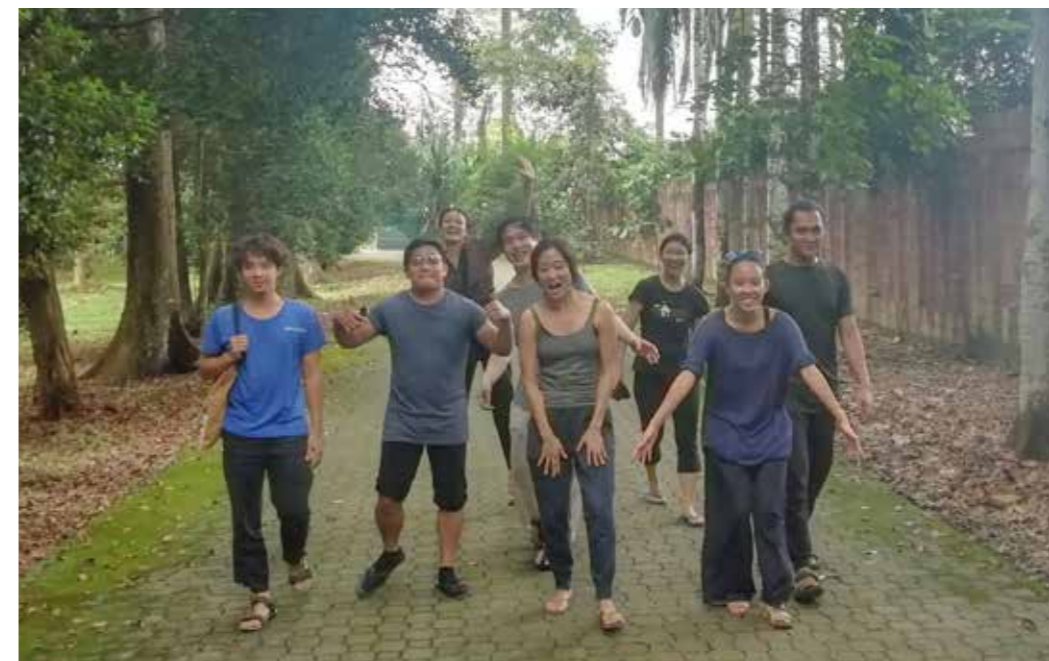
The Southeast Asian dancers participating in the Kuala Lumpur production of INSIDE OUT, excited to be returning to the studio at Rimbun Dahan after lunch.