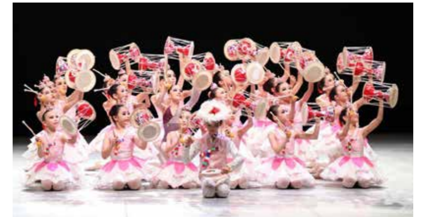
'Janggu Festival', a group performance at Tanzolymp Asia, Chung-Ang University – Art Center, 28 July 2019.